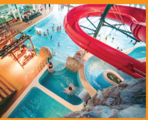
12 WATER AMUSEMENT PARK