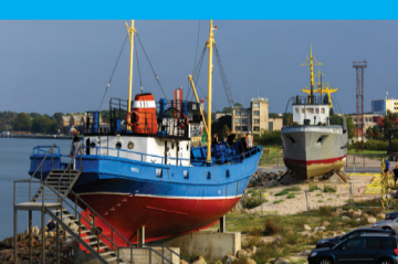
25 FISHING VESSELS "GROTS" AND "AZOVA"