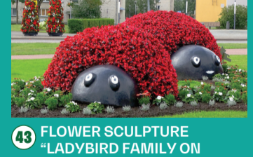
43 FLOWER SCULPTURE "LADYBIRD FAMILY ON A DAISY"