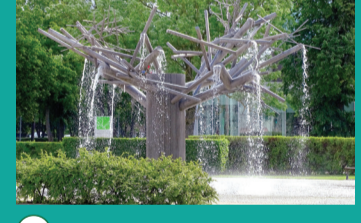
42 FOUNTAIN "DUNE PINE"