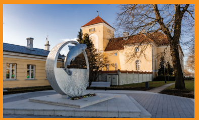
3 LIVONIAN ORDER CASTLE AND ENVIRONMENTAL OBJECT "LATS"