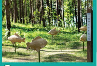
51 FISH SCULPTURES