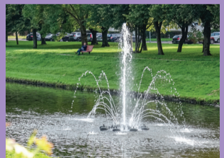
40 VIDUMPĪTE FOUNTAIN AT SHOPPING CENTRE "TOBAGO"