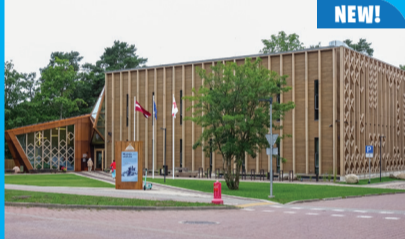
16 SEASIDE OPEN AIR MUSEUM Rinka iela 2, Ventspils