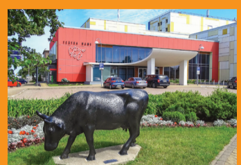
6 THEATRE HOUSE "JŪRAS VĀRTI"