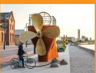
5 OSTAS STREET PROMENADE