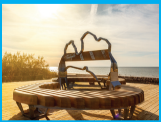
21 ENVIRONMENTAL OBJECT "LATVIAN CONTOUR LINE"