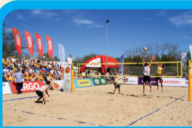
20 BEACH VOLLEYBALL STADIUM