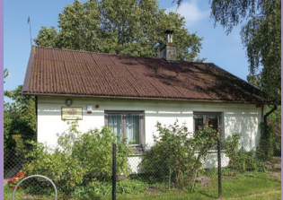
32 H.DORBE MUSEUM "ANCESTRAL DUST"