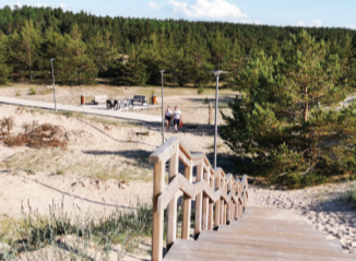
15 ENTRANCE TO THE SEA Boardwalk 10 (dog-friendly walking area)