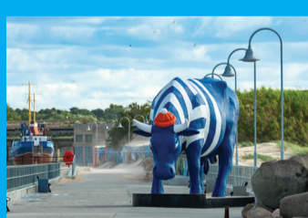
27 SAILOR COW