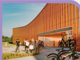
37 SCIENCE CENTRE "VIZIUM"