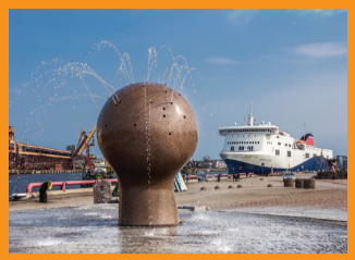
2 FOUNTAIN "SHIPWATCHER"