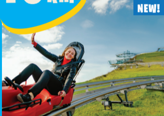
13 ADVENTURE PARK AND TOBOGGAN TRACK