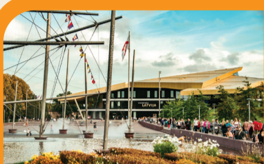
8 CONCERT HALL "LATVIJA" AND FOUNTAIN "FRIGATE "WOLFISH"" Big Square