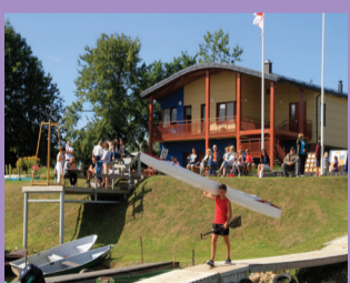
34 ROWING BASE "DAMPELI"