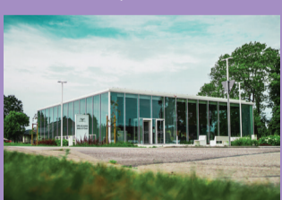
33 GĀLINCIEMS COMMUNITY CENTRE