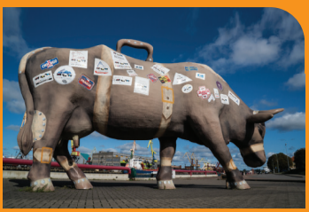
4 TRAVELLING COW