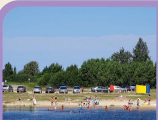
36 RESTING PLACE BY RIVER VENTA