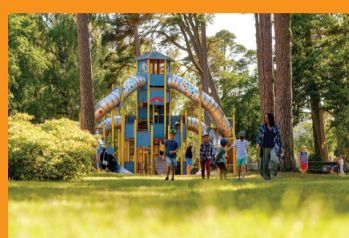
7 CHILDREN'S TOWN Events on Sundays at 11.00