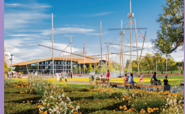
30 CONCERT HALL "LATVIJA" AND FONTAINE "FRIGATE "WALFISH""