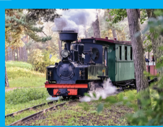
17 LOCOMOTIVE "MAZBANĪTIS"