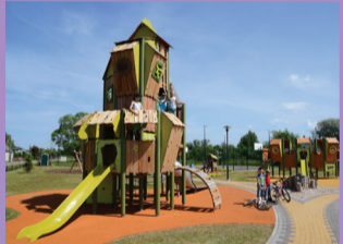
35 PLAYGROUND "WONDERLAND"