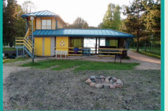
47 BOAT BASE ON LAKE BŪŠNIEKU