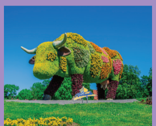
39 FLOWER COW