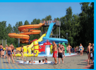
22 BEACH WATERPARK