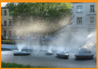
9 FOUNTAIN "SUN BOATS" AND FLOWER SCULPTURE "BOBSLEDDERS" New Town Square