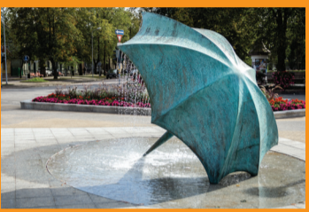
10 FOUNTAIN "UMBRELLA" Laikrakstu avenue