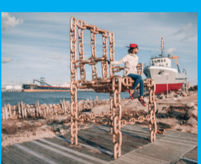
26 CHAIR OF CABLES