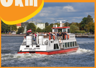
1 EXCURSION BOAT "HERCOGS JĒKABS"