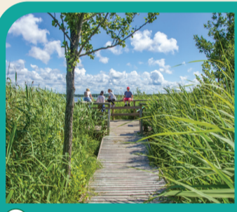
48 LAKE BŪŠNIEKU Watchtower for bird watching