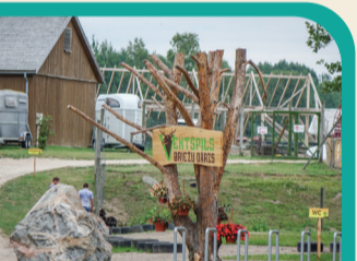
49 VENTSPILS DEER GARDEN