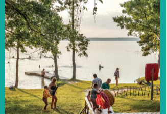
50 LAKE BŪŠNIEKU AND SWIMMING AREA