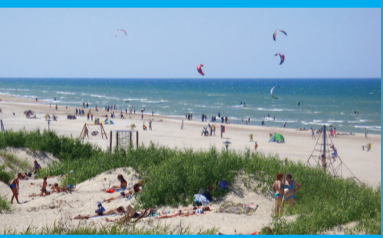
23 BLUE FLAG BEACH