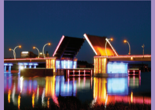
38 VENTA DRAWBRIDGE