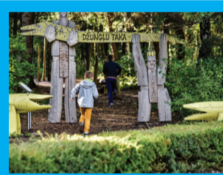
19 JUNGLE TRAIL