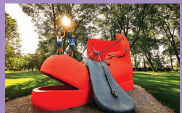
31 RENĶA GARDEN WITH OUTDOOR FITNESS EQUIPMENT, PLAY EQUIPMENT AND FOUNTAIN