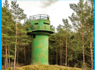
14 MILITARY HERITAGE Fire Correction Tower of the 46th Coastal Defence Battery