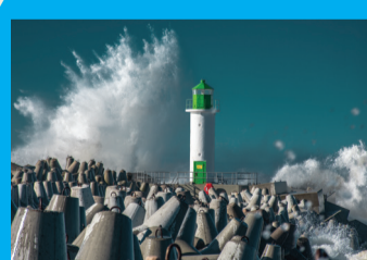
28 SOUTH PIER LIGHTHOUSE