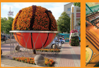
11 FLOWER SCULPTURE "BASKETBALL" Olympic Centre "VENTSPILS"