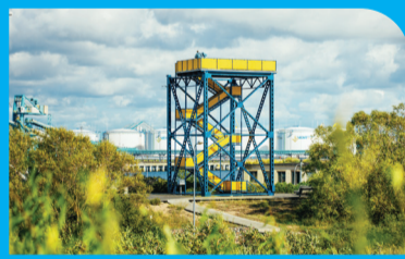
24 SOUTH PIER WATCHTOWER