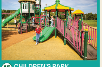
45 CHILDREN'S PARK "FANTĀZIJA" Events on Sundays at 15.00