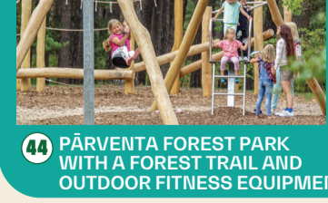
44 PĀRVENTA FOREST PARK WITH A FOREST TRAIL AND OUTDOOR FITNESS EQUIPMENT