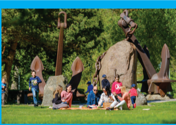
18 SEASIDE PARK