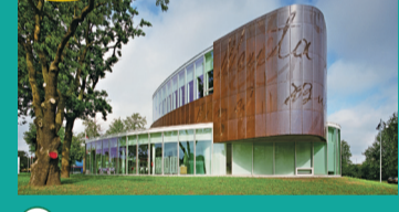
41 PĀRVENTA LIBRARY