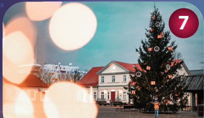
Christmas Market at the Old Town Market Square

A beautifully decorated and illuminated Christmas tree welcomes visitors in front of St. Nicholas Church. Angels playing trumpets adorn the lamp posts, inviting people to visit the Nativity scene.