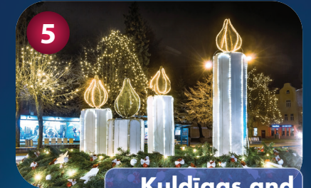
Kuldīgas and Ganību Street

— Recommended route 🎄 Christmas trees ●●● Light elements ● Decorations