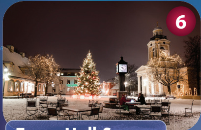
Town Hall Square (Rātslaukums)

The city's main Christmas tree proudly stands in Lielais Square, right in the heart of the city. It is surrounded by a composition of shimmering musical instruments, creating a festive atmosphere. The 2025 symbol, accented by the hunting horn from the coat of arms of Ventspils, stands out on Lielais Prospekts.